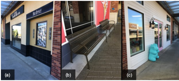
Figure 2. Examples of places for the Place Channel. (a) “box office counter of a theater” (b) “benches outside the ice-cream store” (c) “gummy bear outside the storefront of Margo’s Sweet Shop”

recognize structural landmarks ( e.g. , doors, stairs, windows, elevators, and pillars) and obstacles ( e.g. , tables, chairs, and benches) around the user as they scan the environment. Instead of choosing computationally heavy methods [10,51,54], we used a light-weight pre-trained object recognizer with reasonable accuracy ( F_1 = 69.9 at a 99% confidence threshold for recognition) to run on commodity smartphones. The recognizer is based on the SqueezeNet [23] deep neural network model, and trained on 2,538 randomly selected images from the ImageNet database [15]. As the user pans the phone’s camera, the channel announces landmarks when first recognized and every two seconds the landmark remains in the camera’s view. While a real-world system would likely need to detect a much larger set of landmarks and at a much higher accuracy, constraining the detected landmarks to features common in our study location was sufficient for the purposes of a design probe demonstrating the landmark recognition concept.